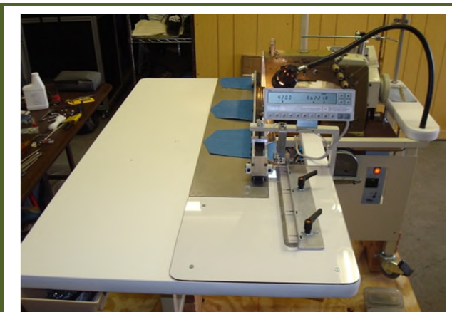
VMW Model 800. Automated Pocket Hemming without Cut-Apart or Stacking

Another difficult operation you want automated? Contact us for Custom Sewing Automation.