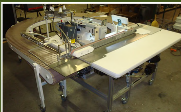
VMW Model 1500. Automated Pocket Hemming with Cut-Apart & Stack (1500DF w/ Pegasus W522) Model 1500NF with Pegasus TM-625 Model 1500NF-EC with Electronic Drive Conveyor